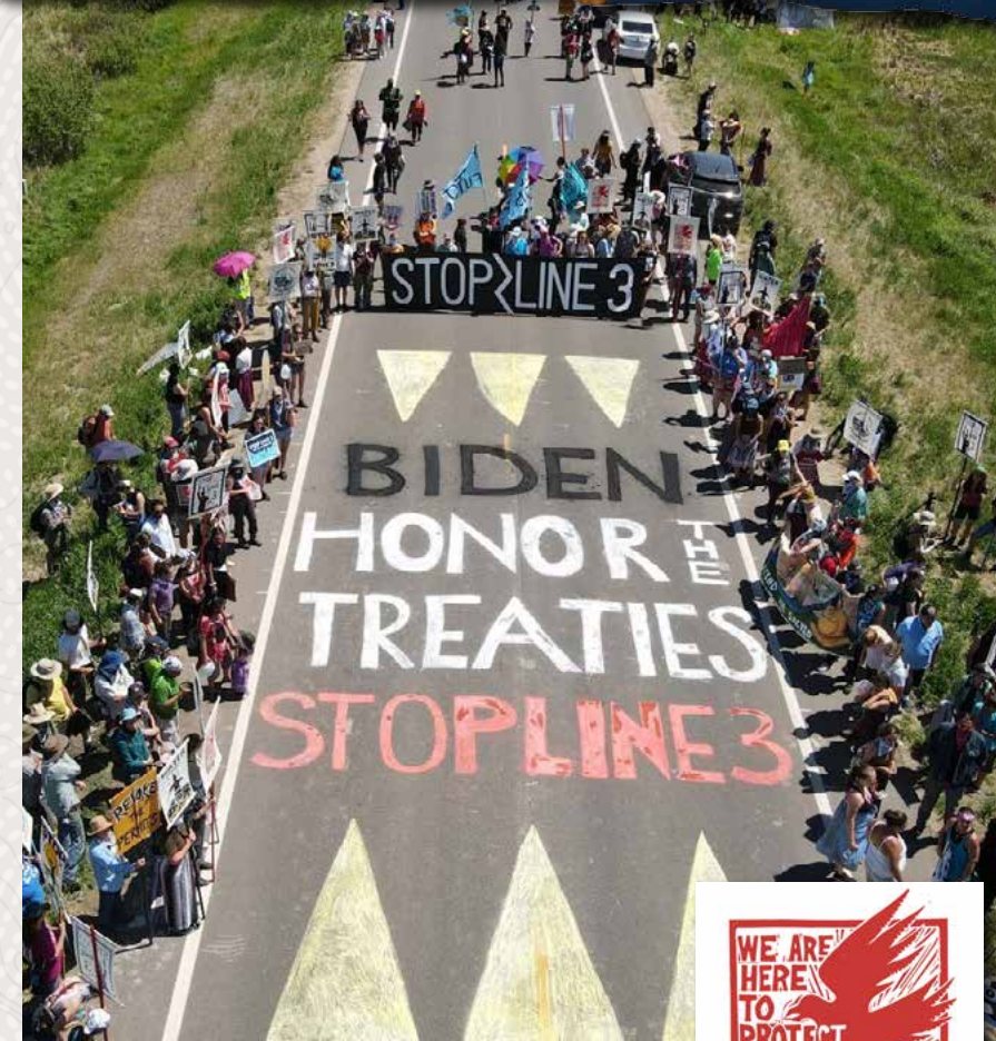
Equation Campaign staff joined thousands of people from around the world at the Line 3 Treaty People Gathering in Northern Minnesota.