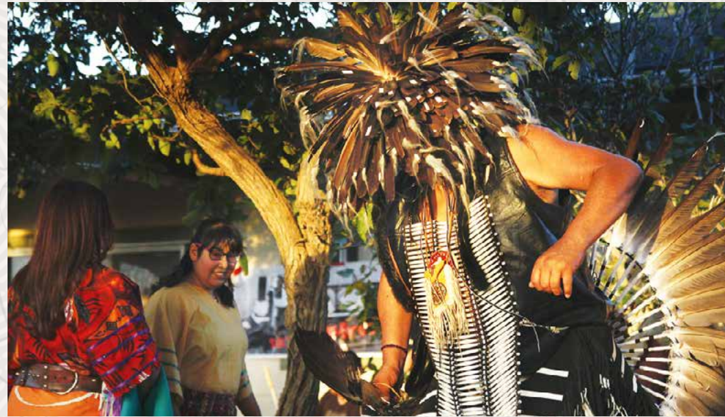
Annova abandoned its plans for its LNG fracked gas export terminal after years of resistance by the Carrizo Comecrudo Tribe of Texas and its state and national allies.