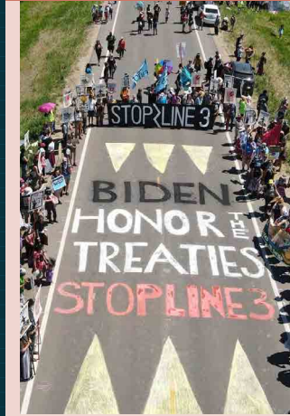
HONOR THE EARTH

Indigenous communities and water protectors, including Honor the Earth and Giniw Collective , called on President Biden to revoke Trump-era permits and fulfill promises to respect climate science and respect indigenous sovereignty at the Treaty People Gathering in Northern Minnesota. There was strength in numbers at the headwaters of the Mississippi River in Anishinaabe territory as state and national organizations like Minnesota Interfaith Peace and Light , US Climate Action Network , and the Center for Protest Law and Litigation backed them up.